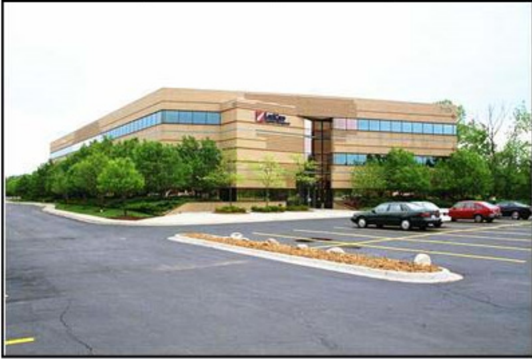
Orchard Pointe 7025 Orchard Lake, West Bloomfield (60,000 square feet)