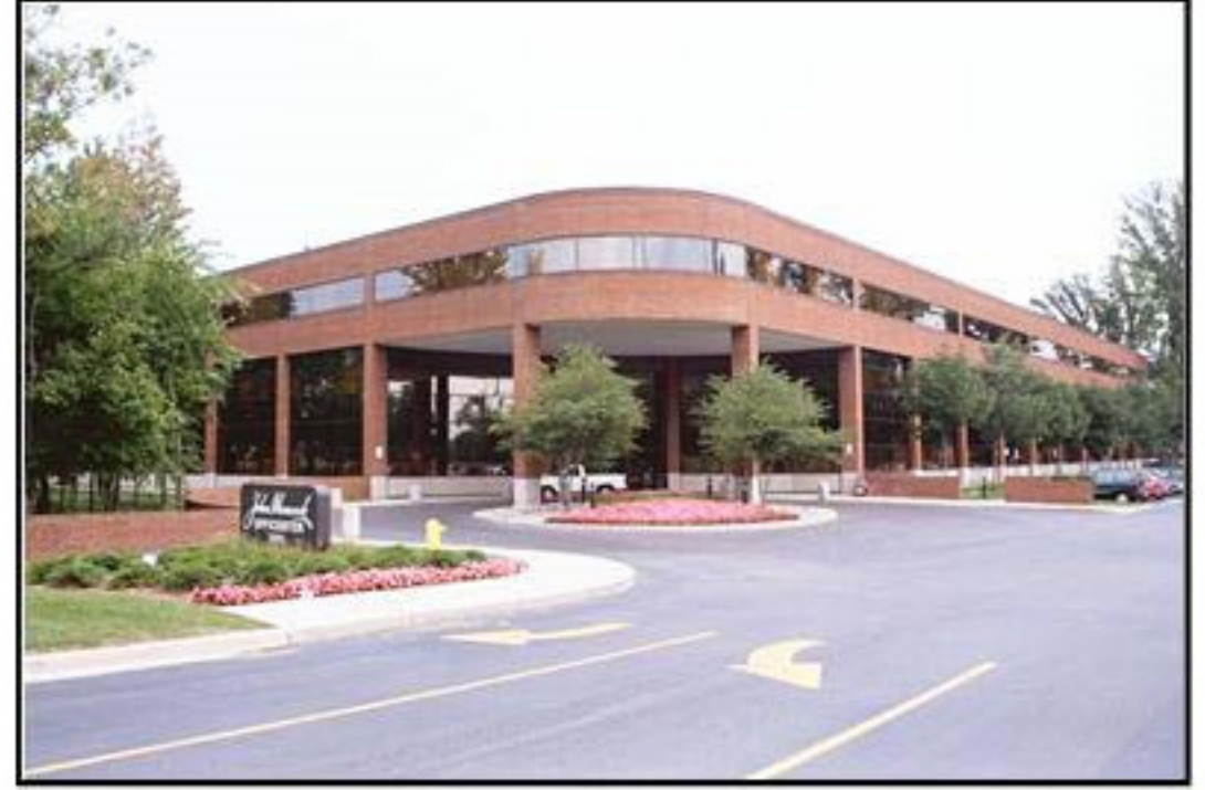
John Hancock 32000 Greenfield, Dearborn (80,000 square feet)