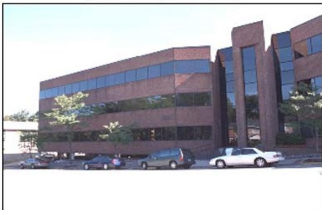
380 Woodward 380 Woodward, Birmingham (40,000 square feet)