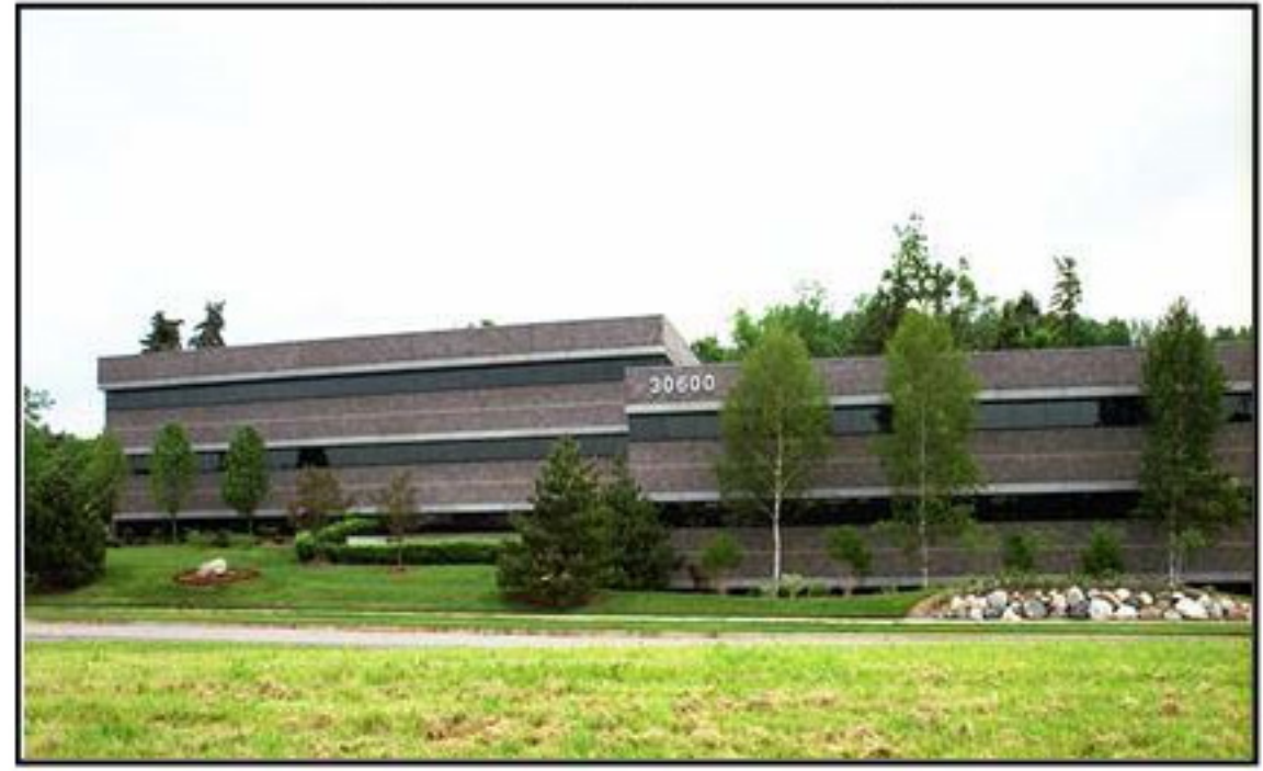
North Valley II 30600 Northwestern, Farmington Hills (65,000 square feet)