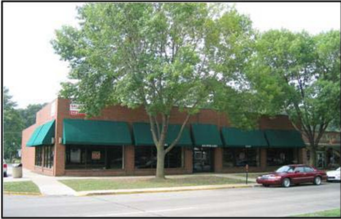
Grosse Pointe One 19435 Mack Ave., Grosse Pointe Woods (7,500 square feet)