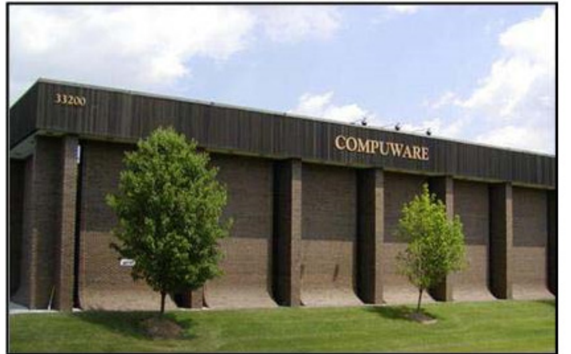
Compuware Building Farmington Hills (40,000 square feet)