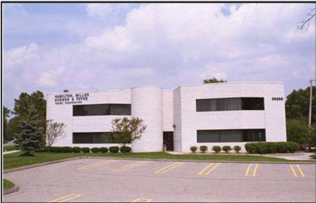
Hamilton Miller 39566 Northwestern, Southfield (22,000 square feet)