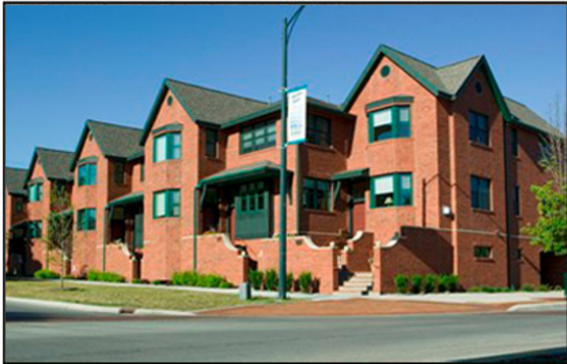
The Brownstones Boardman Ave., Traverse City (22,500 square feet)