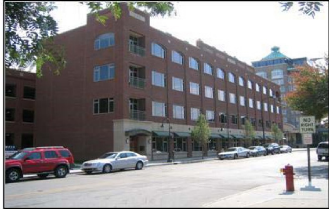
Radio Centre Phase II 125 Park St., Traverse City (29,000 square feet)