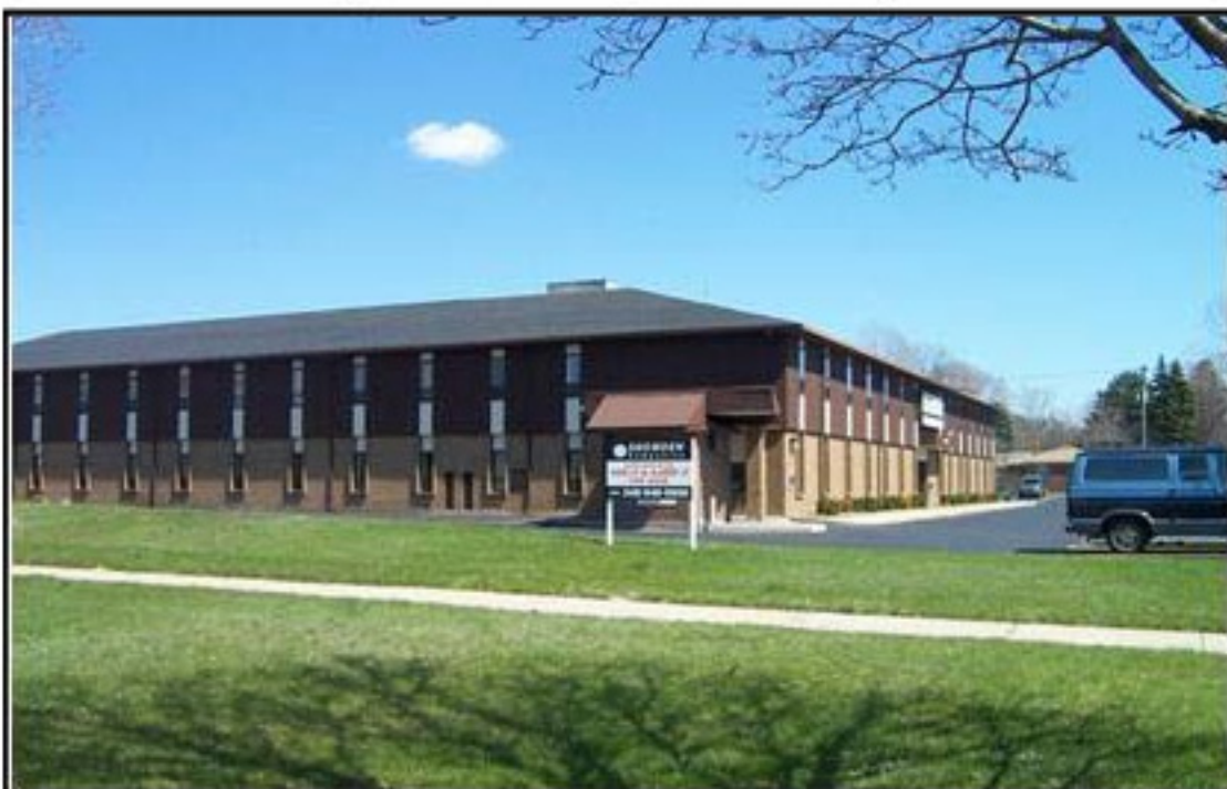
Southfield One 21800 W. Ten Mile Rd. & 25160 Lahser Rd. (42,000 square feet)