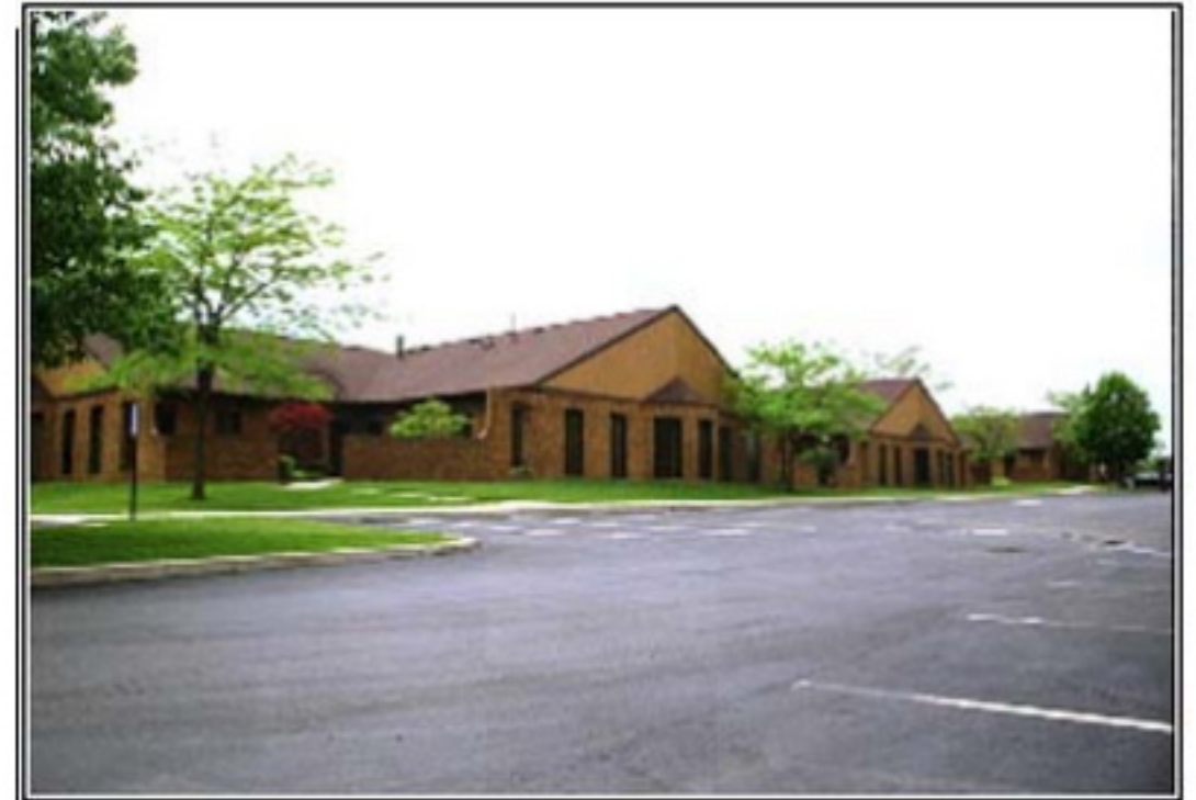
7001 Orchard Lake, West Bloomfield (68,000 square feet)