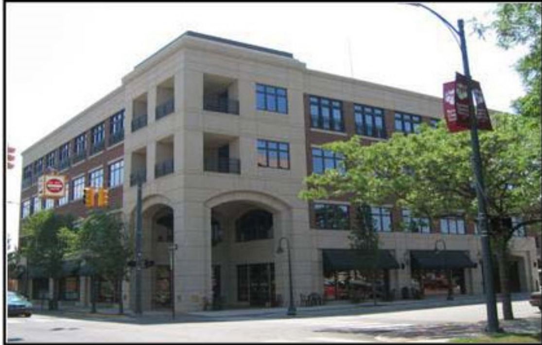
Radio Centre Phase I 300 E. Front St., Traverse City (40,000 square feet)