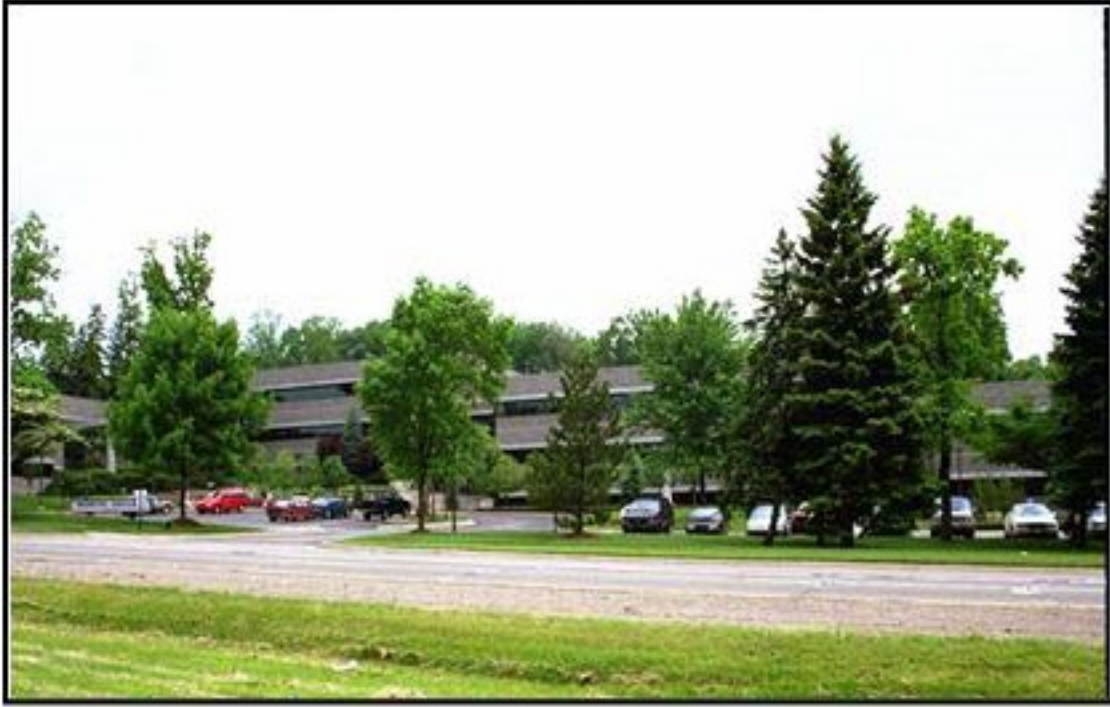
North Valley I 30500 Northwestern, Farmington Hills (88,000 square feet)