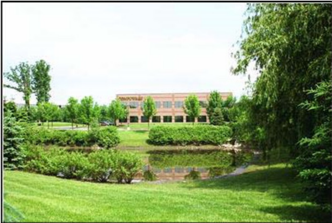
Compuware 31440 Northwestern, Farmington Hills (40,000 square feet)